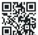
QR Code for School Website