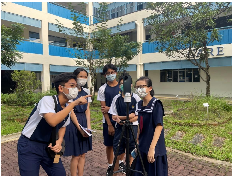
ESC members taking photos using VR tool kit