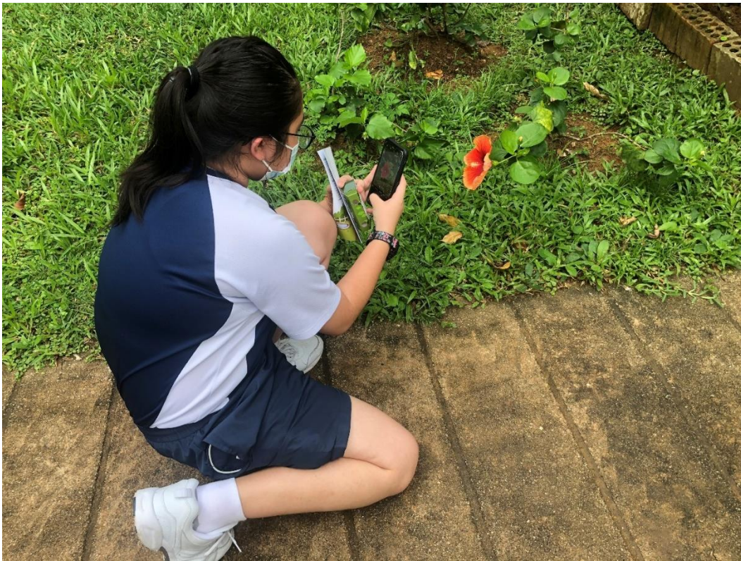
ESC member using google lens to learn about flora in WGS

https://app.lapentor.com/sphere/woodgrove-secondary-school-esc-biodiversity-trail